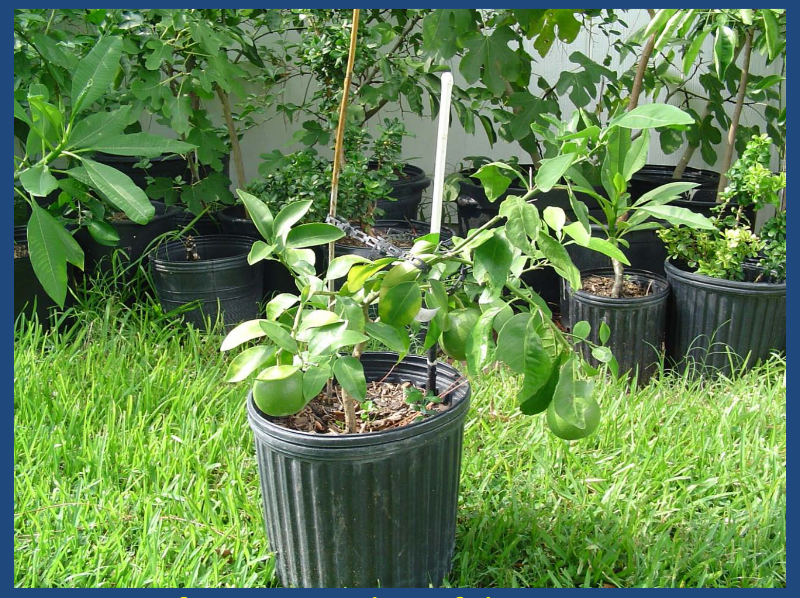
Dwarf Severenia buxafolia supporting a Golden grapefruit with early fruit set