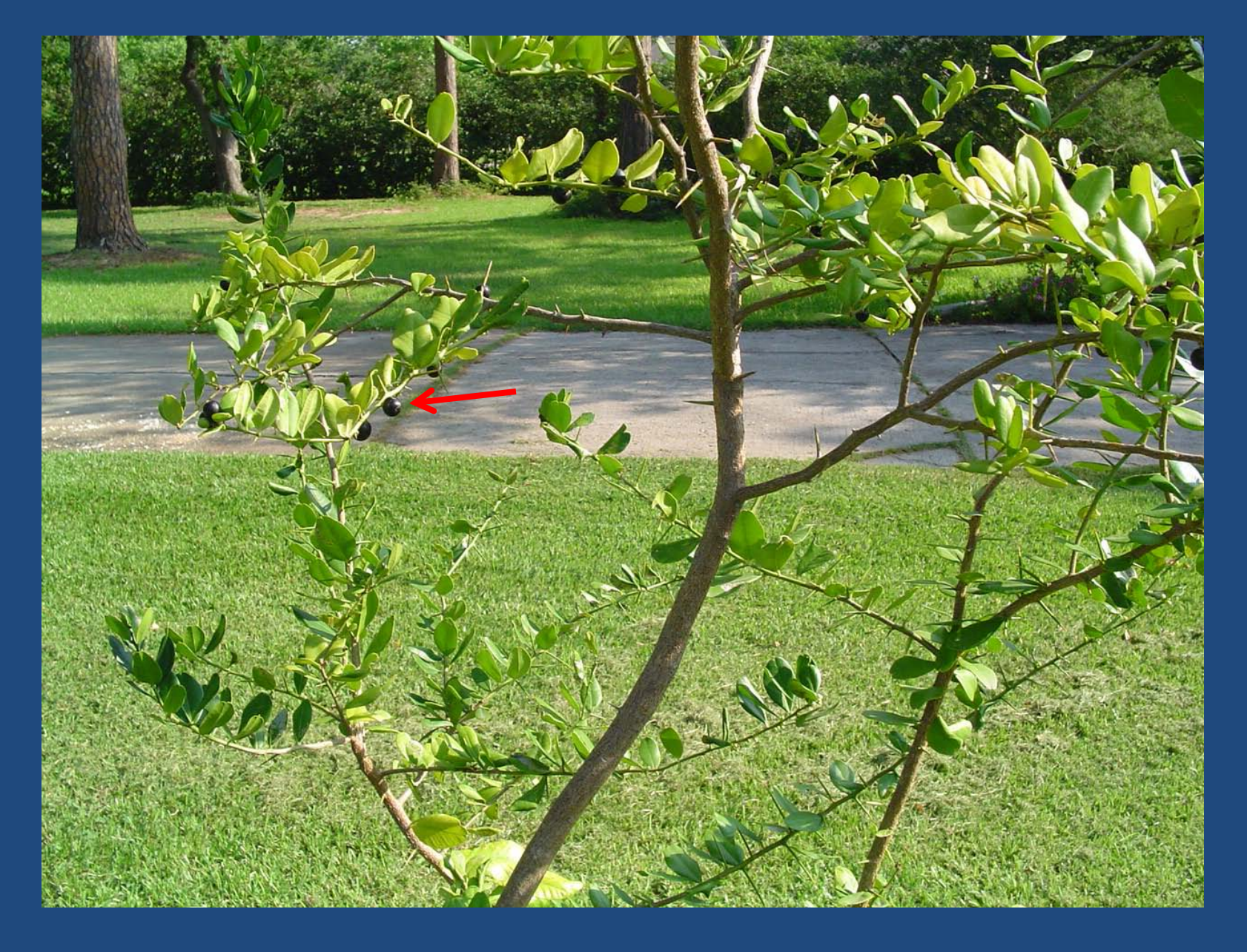
Small Black Fruit (arrow) with Single Seed and Thorns on Standard Severenia buxafolia